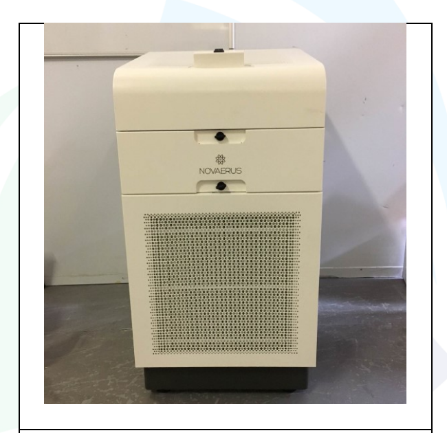
Figure 2.1. Novaerus (NV1050) air purifier tested at airmid healthgroup

The Novaerus (NV1050) air purifier was received by airmid healthgroup on 06/04/2018 (Figure 2.1).